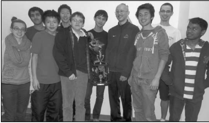
K-12 Team: Co-Champions Ann Arbor Huron