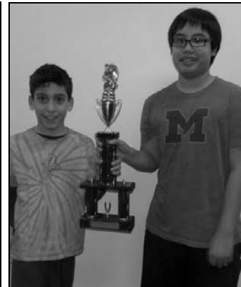
K-12 Team: 4th Place Relocated Knights