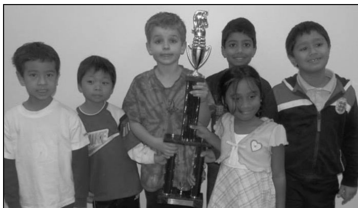
K-3 Team: 2nd Place J-FORCE