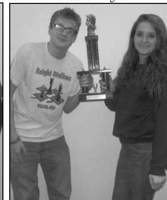
K-12 Team: 7th Place Clio High School