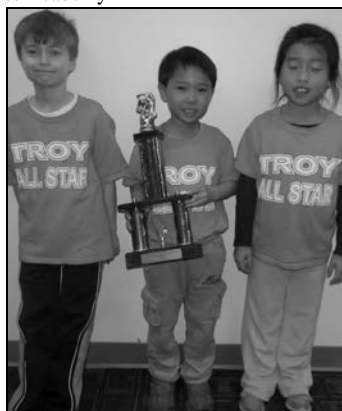
K-3 Team: 7th Place: Troy All-Stars