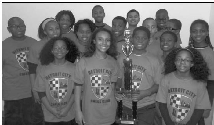
K-8 Team: 2nd Place / State Champion Detroit City Chess Club