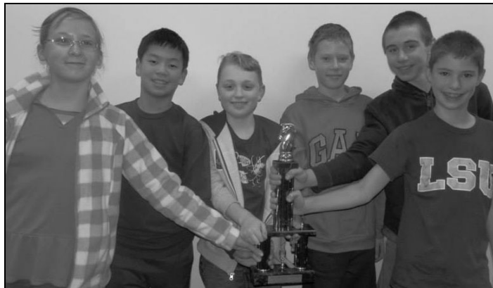
K-8 Team: 6th Place Jefferson Middle School