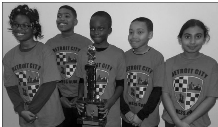
K-5 Team: 5th Place Detroit City Chess Club