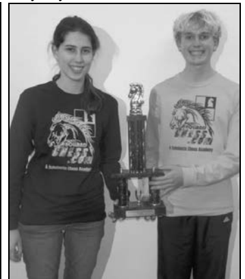
K-12 Team: 6th Place Holland Chess Academy