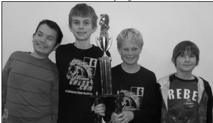
K-8 Team: 3rd Place Holland Chess Academy