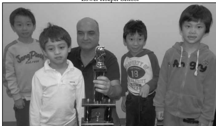
K-3 Team: 6th Place Windsor Friday Knights