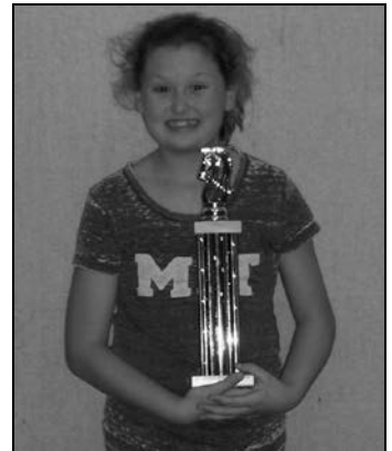
Reserve: 1st U800