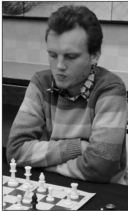
Number 1 Seed, GM Timur Gareev