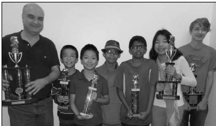
K-8 Team: 1st Place Windsor Friday Knights