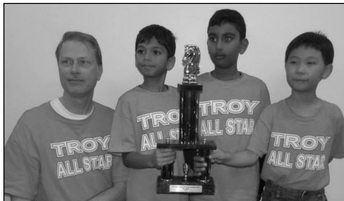
K-5 Team: 7th Place Troy All-Stars