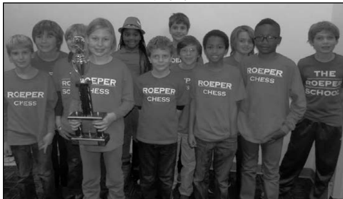
K-5 Team: 4th Place Lower Roeper School