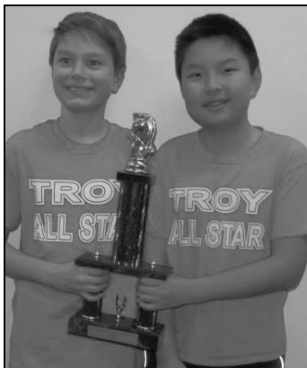
K-8 Team: 7th Place Troy All-Stars