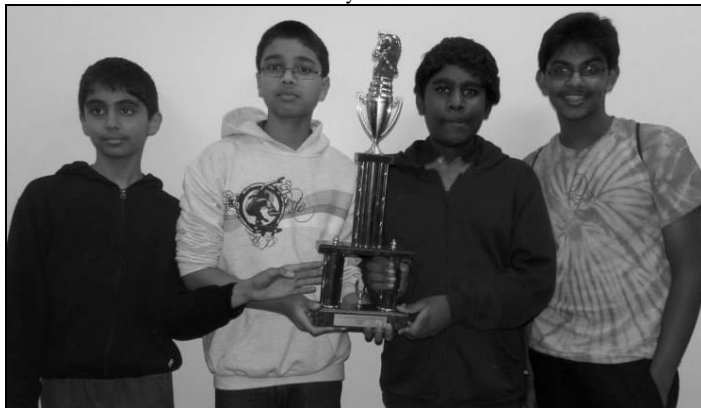
K-8 Team: 4th Place J-FORCE