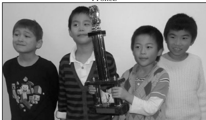
K-3 Team: 5th Place Michigan Chess Academy