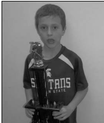
K-5 Team: 8th Place Okemos