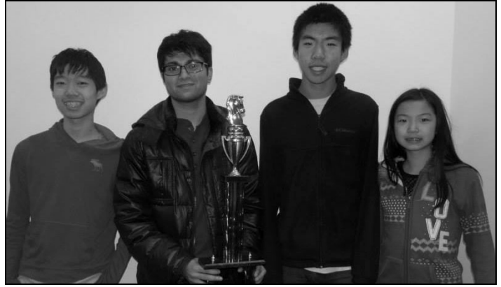
K-12 Team: Co-Champions Detroit Country Day