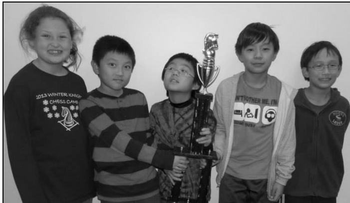
K-5 Team: 2nd Place (State Champion) J-FORCE