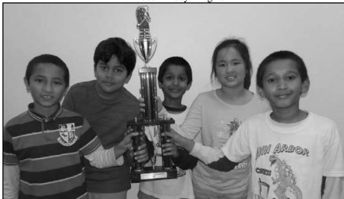
K-5 Team: 3rd Place Ann Arbor Monsters