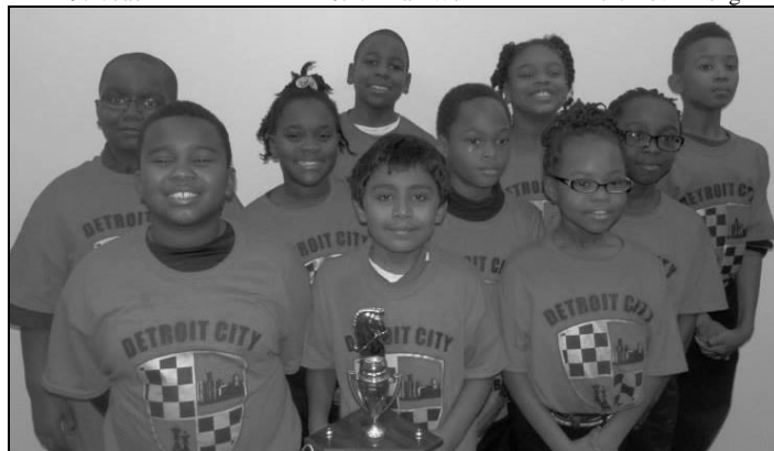
K-3 Team: 1st Place / State Champion: Detroit City Chess Club