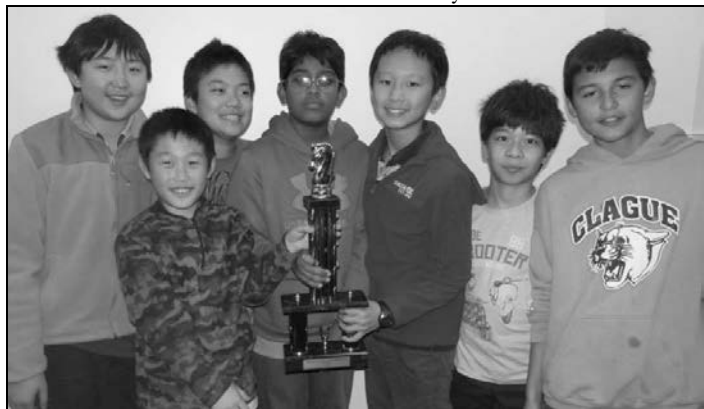
K-8 Team: 5th Place Ann Arbor Clague