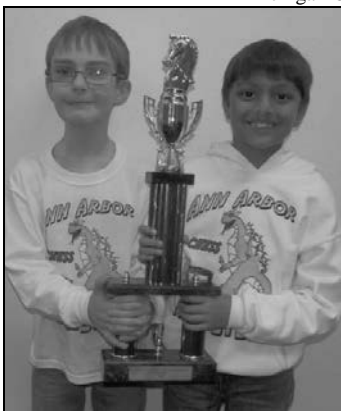
K-3 Team: 4th Place Ann Arbor Monsters