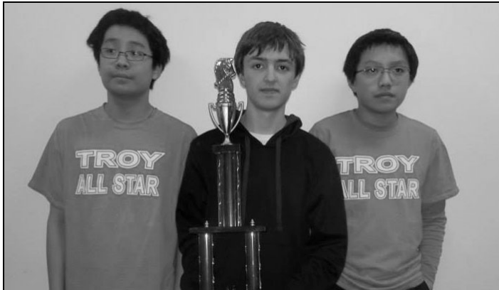
K-12 Team: 3rd Place Detroit Country Day