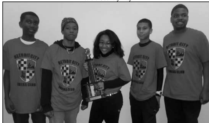
K-12 Team: 5th Place Detroit City Chess Club