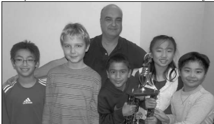
K-5 Team: 1st Place Windsor Friday Knights